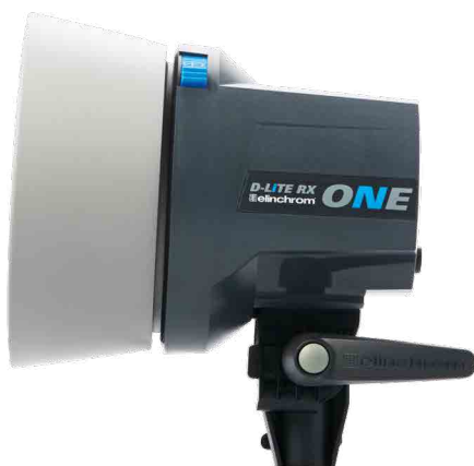
D-Lite RX ONE — 100 Ws — N° 20485.1