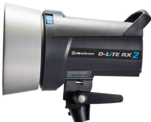
D-Lite RX 2 — 200 Ws — N° 20486.1